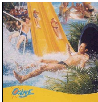
Oceade Water Park