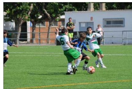
Participants in Primavera Cup 2008