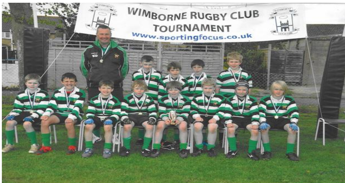
Minchinhampton U9's – Wimborne Festival winners 2010

The festival will follow the RFU regulations and we will endeavour to ensure all sides will receive the maximum amount of Rugby available to them under the RFU regulations. Once the festival is over you will return to the Holiday Park to continue your celebrations, and make the most of the parks facilities where a visit to the arcades or the pool and spa complex is highly recommended. In the evening, you can enjoy a show in one of the themed bars or cabaret clubs on-site which is included in your price.