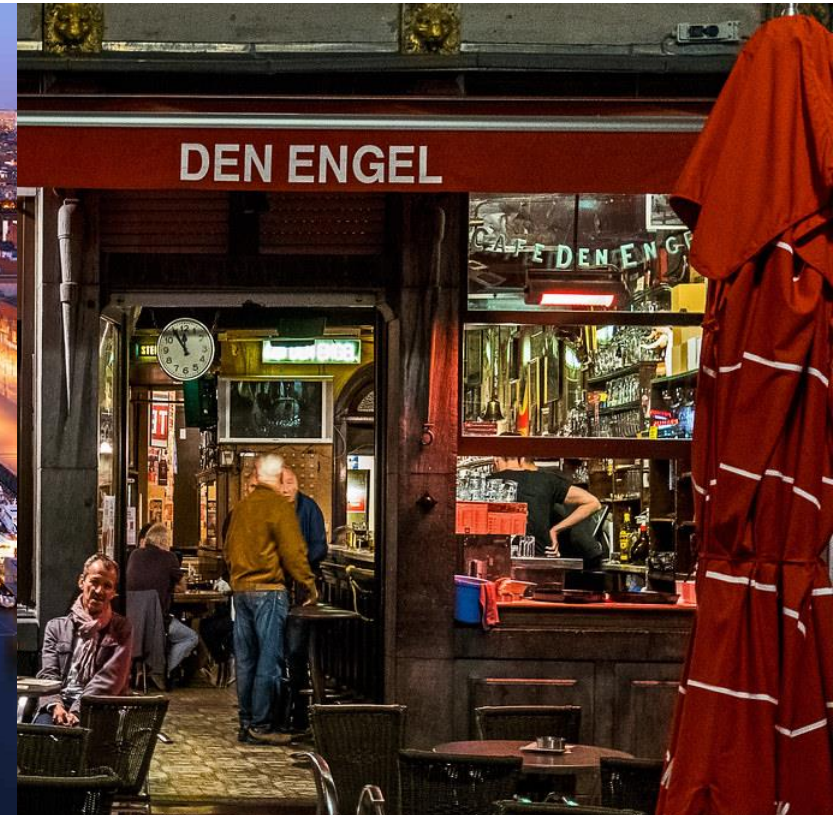
Den Engel Bar