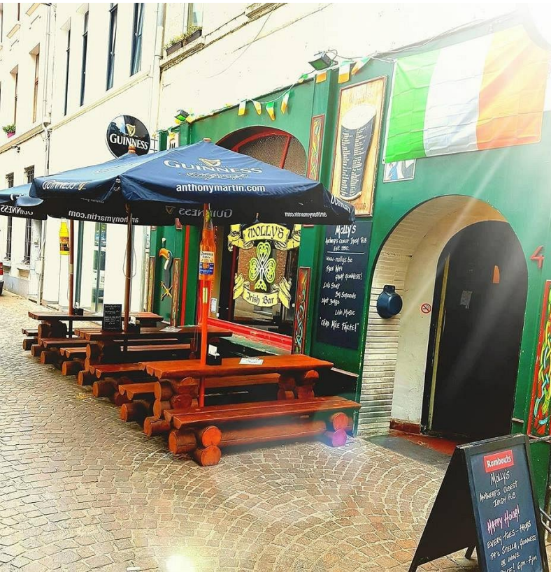
Molly's Irish Pub