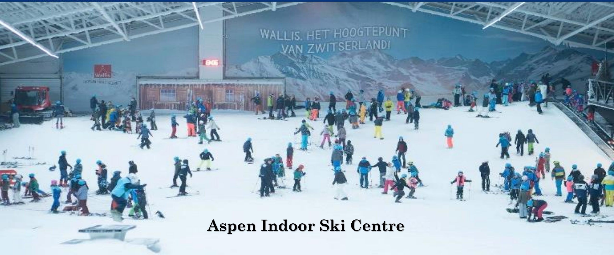
Aspen Indoor Ski Centre