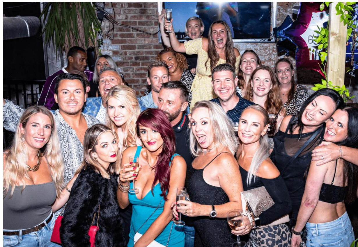
Dancing Jug Coacktail Bar