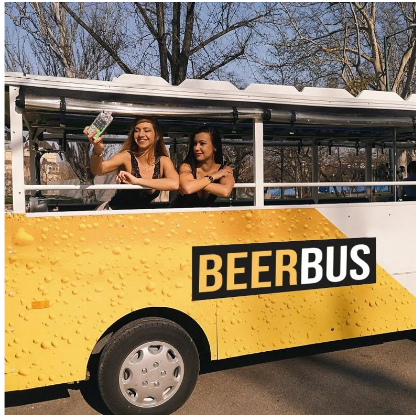
BUDAPEST BEER BUS