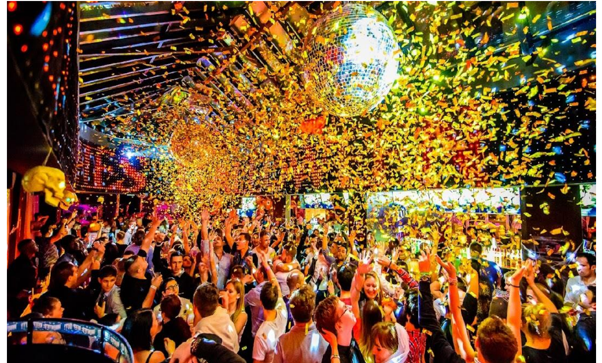
Peaches & Cream