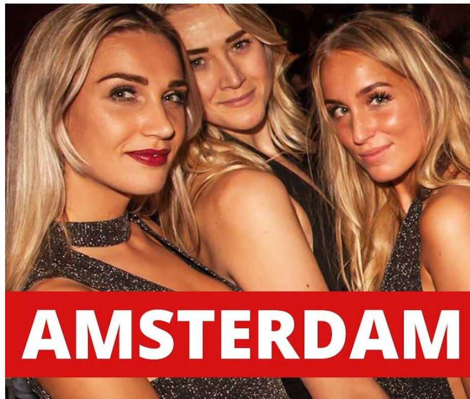
Satellite Sports Cafe