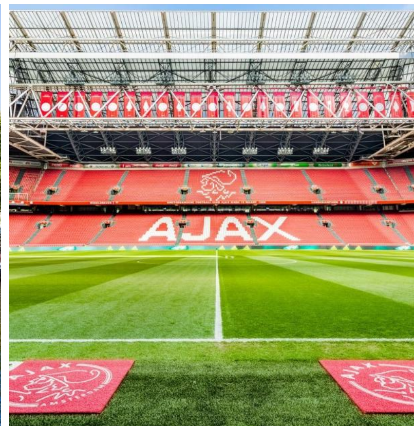
Ajax Stadium Tour