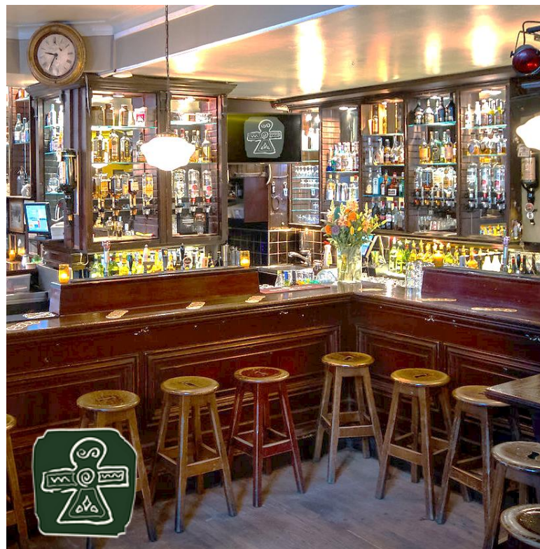
O'reilly's Irish Pub