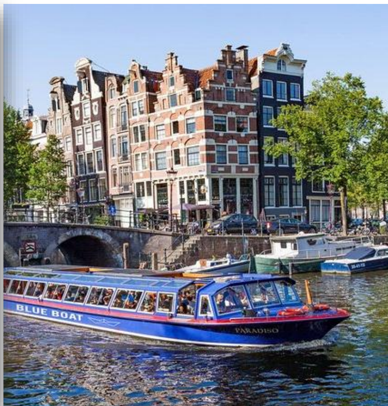
Canal Cruise with Open Bar