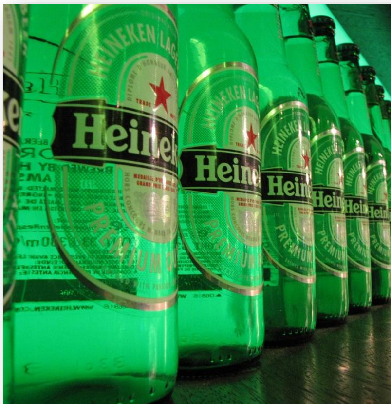
Heineken Brewery Experience