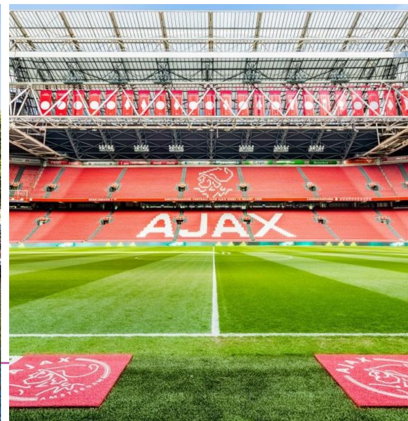
Ajax Stadium Tour